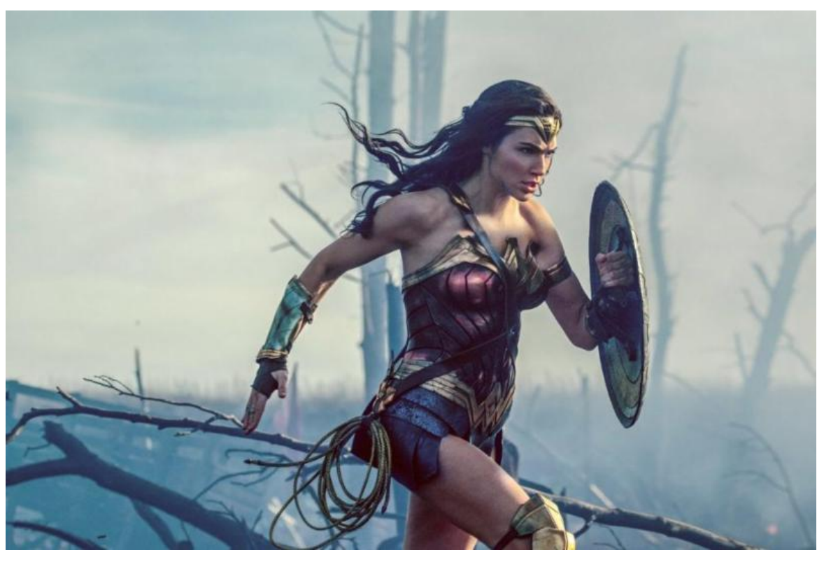
Gal Gadot, who stars in the blockbuster "Wonder Woman,"